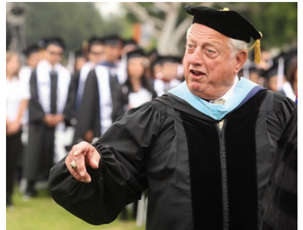
The Los Angeles Dodgers' Tommy Lasorda and Regina E. Dugin, director of the Defense Advanced Research Project Agency, spoke at Commencement 2011.

Regina E. Dugin, director of the Defense Advanced Research Project Agency, took to the podium on Sunday, May 22. More than 10,000 grads were eligible to participate in the commencement ceremonies.